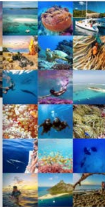
www.luxlife.com Page 20

personal care to each guest. They are the heart of the service, they are the soul of the brand. They are the ones who make the difference. They are the ones who make the difference. They are the ones who make the difference.